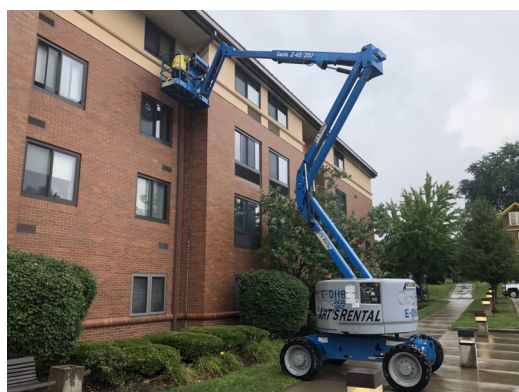
Evanston Exterior Repair

Update on Evanston Preservation Renovation work at The Evanston was temporarily put on hold due to the pandemic. Now the conversion work is back on track and moving forward. Nearly half of the 100 units are complete and the families have started moving back to newly modernized homes. The preservation work is estimated to cost $3M and includes new flooring, kitchen upgrades, bathroom upgrades, ADA updates, electrical repair and fresh paint work. Furthermore, additional safety measures are taking place in each unit, with the installation of two high tech smoke detectors. It is important to point out that the construction crew is required to follow COVID-19 policies. In addition, the crews use CDC approved cleaning methods in the units before families move in their renovated homes.