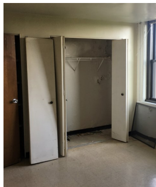
Riverview Unit Before

Elevated Repairs: CMHA's construction team along with its elevator contractor dug deep to find ways to get the elevators at San Marco and the President moving more efficiently. Residents were alerted that the elevators would temporarily be unavailable. New roller guides, cables and interlocks are just a few of the upgrades that were done at San Marco. A new door operator package was installed and it provides feedback to the control system about whether or not the doors close properly.