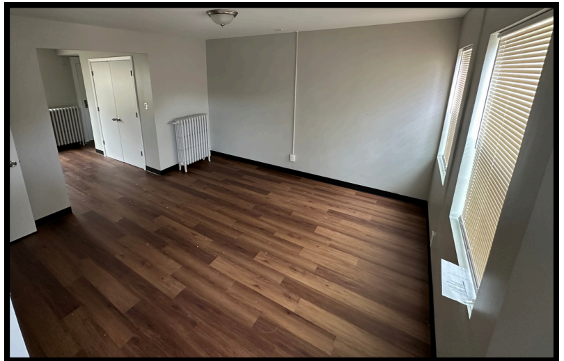
Winton Terrace property after a renovation from a fire.