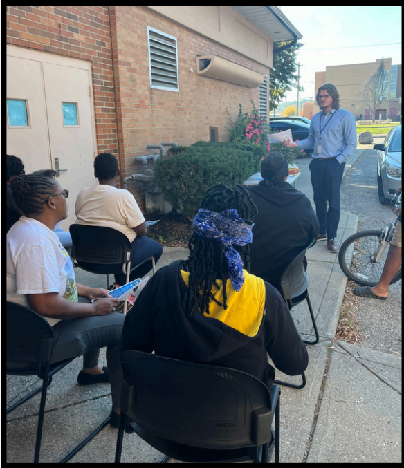
RAD Resident meeting at Millvale

As CMHA begins to enter the application phase of RAD projects, the Development Team has been working to ensure that all residents are informed of the process and what to expect in the upcoming weeks and months. RAD Resident meetings are being held at Marquette Manor of English Woods, which is expected to receive RAD Conversion Commitment (RCC) in the upcoming weeks. RCC is issued after HUD reviews and approves the Financing Plan submitted by the Housing Authority. Receiving this commitment means that HUD has approved the Housing Authority's RAD plans and that the property can