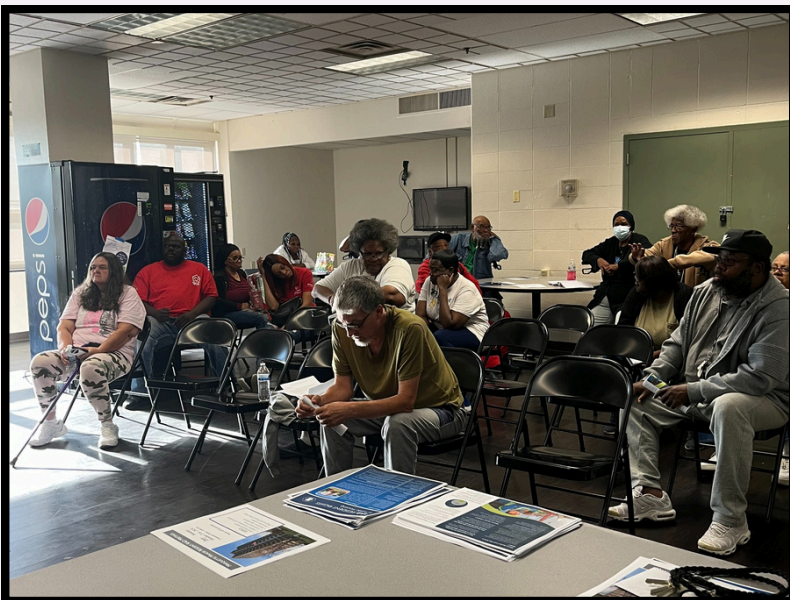
RAD Resident meeting at Marquette Manor 10/21

The Beechwood, located in Avondale, is another property that is expected to receive RCC very soon. Resident meetings are also being held at City West, Millvale, The Redding, The President, Winton Terrace, and Findlater Gardens in preparation for RAD.