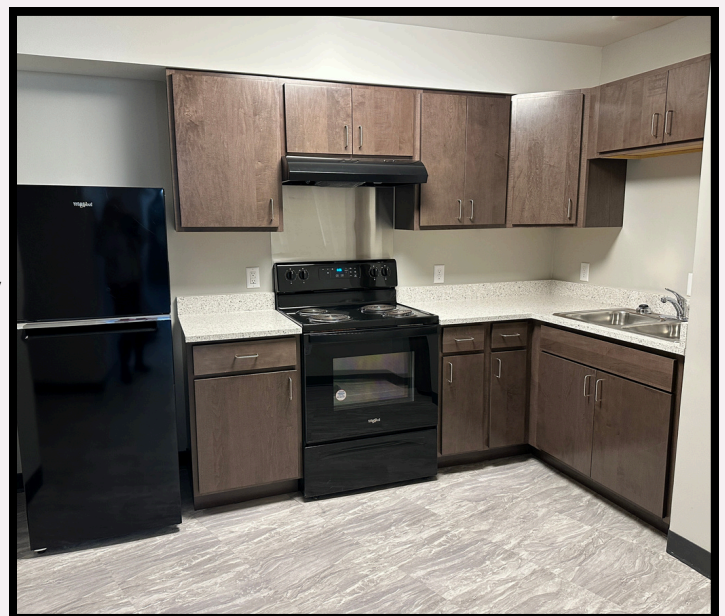
A new kitchen in San Marco

Over the last year, CMHA renovated the units and building with a partial makeover including updated plumbing and some electrical systems. Each unit now has brand new kitchen cabinetry and appliances, new bathrooms with updated showers, tile, and vanities, updated lighting, and new LVT flooring throughout the units. These upgrades provide residents the ability to live