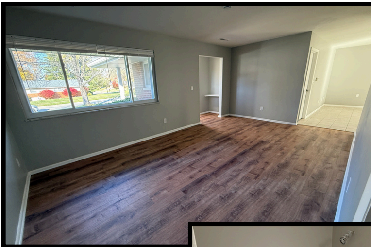
Rosetree Lane's updated Living Room and Bathroom

The new resident is thrilled to move in to the renovated house. It is in a prime location of Anderson Township, where the local school bus pickup is right outside the front door, making it easier for the family to ensure their child has transportation to and from school.