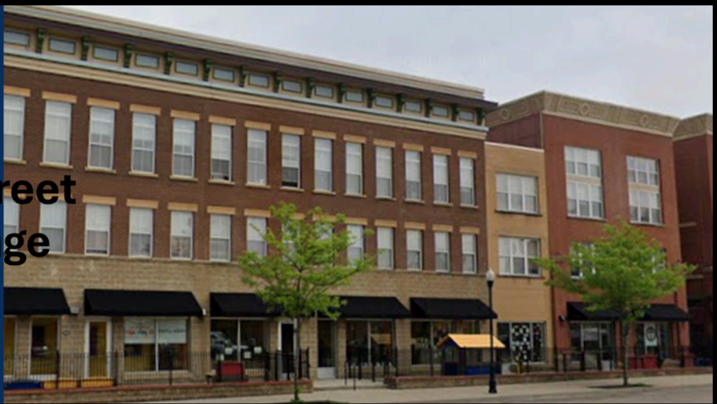
Linn Street Exchange

As part of the building renovations, CMHA is working toward repositioning or preserving 581 units. CMHA will renovate 62 units located on Linn Street, known as Linn Street Exchange.